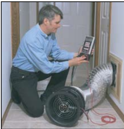
The Minneapolis Duct Blaster® is used to measure the airtightness of duct work.

Other building diagnostic products available from The Energy Conservatory