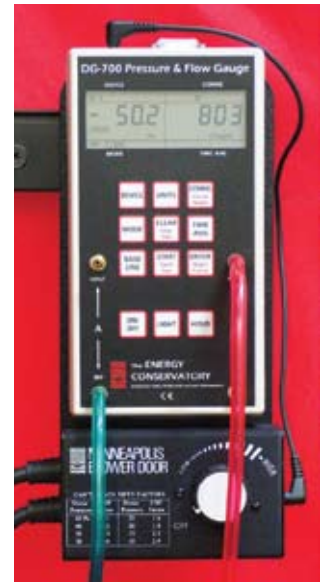
DG-700 Pressure and Flow Gauge with New Cruise feature