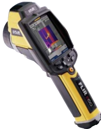
The "b" Series Infrared Camera helps speed up diagnostic work, especially when used with a Blower Door.