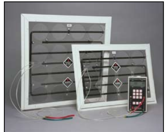
The TrueFlow® Air Handler Flow Meter, shown with DG-700, is used to measure the total amount of air moving through an air handler.